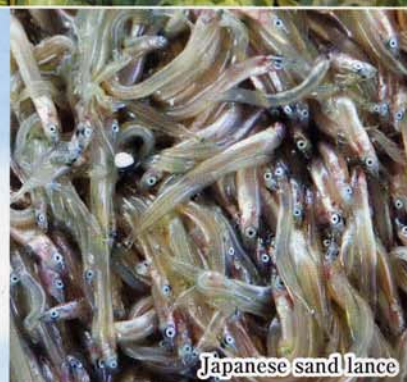
Japanese sand lance