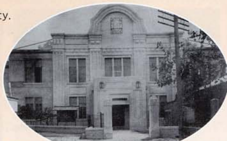
City Hall at the time of the city foundation