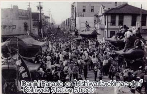
Danjiri Parade on "Kishiwada-ekimae-dori" - Kishiwada Station Street-