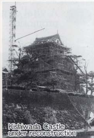
Kishiwada Castle under reconstruction